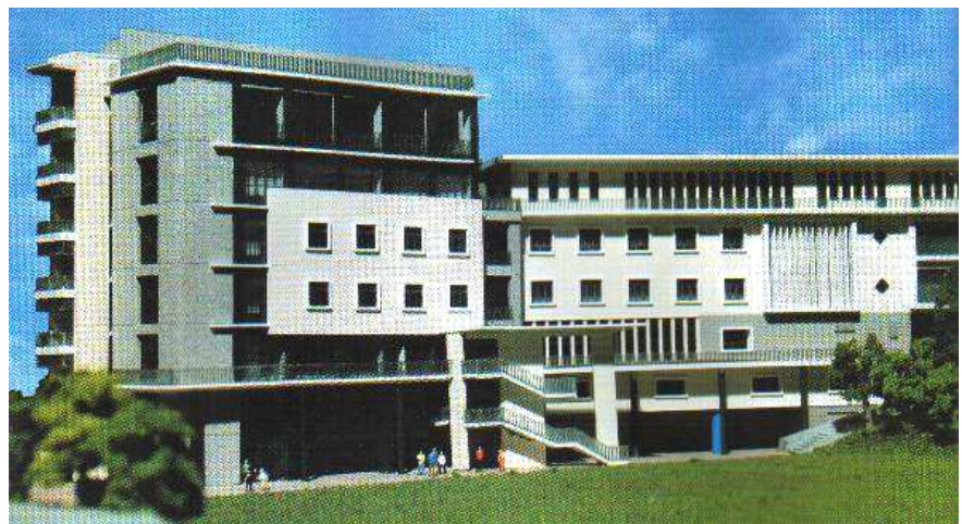
Artist's rendition of the school building with the new extension. The new extension is expected to be completed next year.